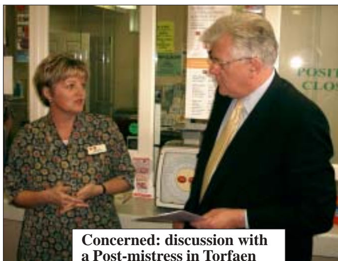
Concerned: discussion with a Post-mistress in Torfaen

The Liberal Democrats are committed to stopping the closure of local post offices. For many people in the community, such as pensioners and the disabled, local post offices provide a vital lifeline. They are often at the heart of many communities. Welsh Liberal Democrats seek to maintain our vital post offices. Labour took away their business making it difficult for many Post Masters and Mistresses to make a living.